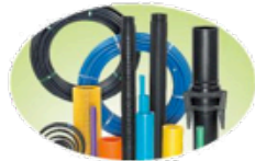
PVC, HDPE Piping Systems