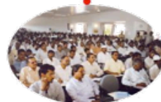
Training & Extension