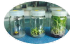
Tissue Cultured Plants & High Quality Seeds