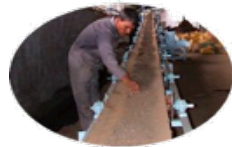
Bio-Fertilisers & Microbial Cultures

We help farmers to produce more and better