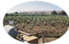
Drip & Sprinkler Irrigation Systems