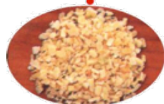
Onion & Vegetable Dehydration

Finally, we process these for export and domestic markets